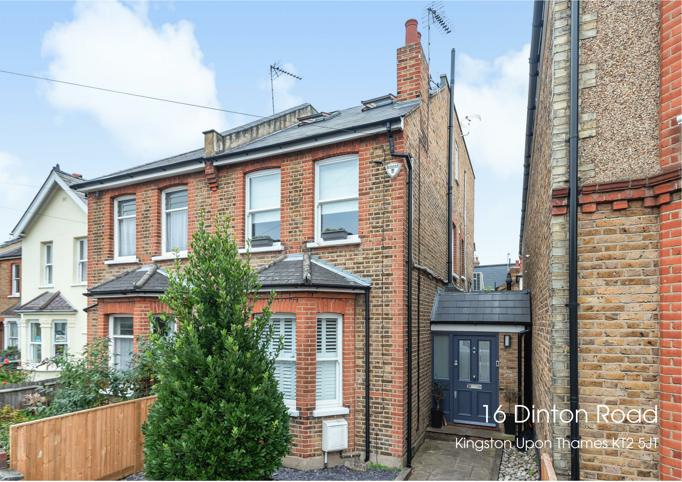
16 Dinton Road Kingston Upon Thames KT2 5JT